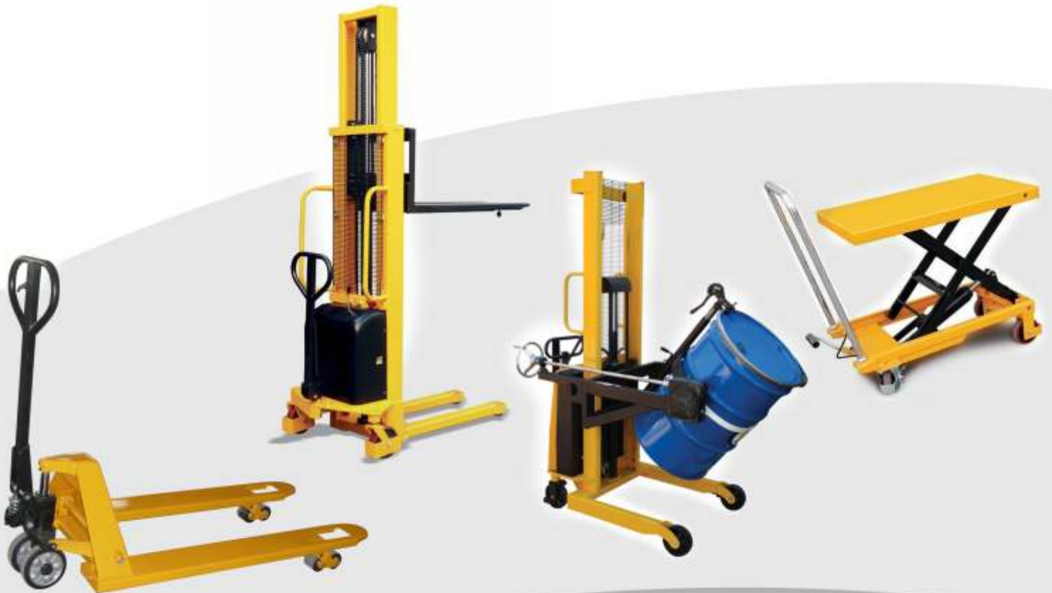
Hydraulic Hand Pallet Truck Hydraulic Stacker Hydraulic Goods Lift