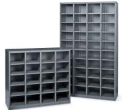
RCK-03 : Heavy And Light Duty Shelves Racking System