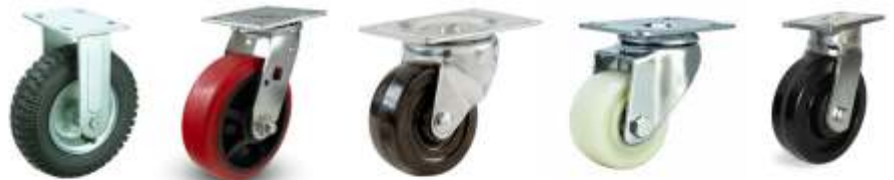
CASTOR WHEEL WITH LOCK