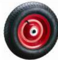
SOLID RUBBER WHEEL