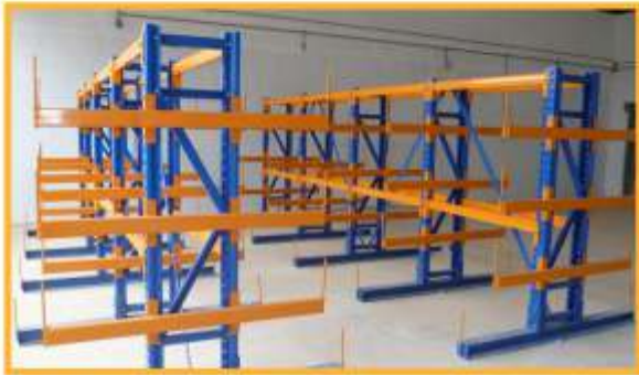
RCK-01 : Cantilever Racking System