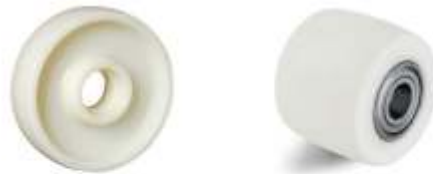
PU COATED WHEEL